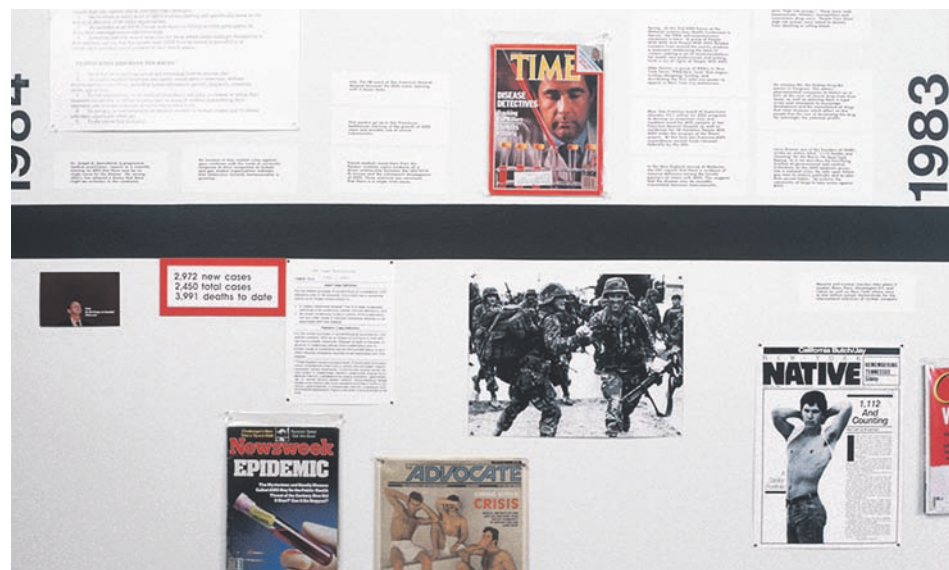
Right: Group Material, AIDS Timeline (detail), 1989, artworks, magazines, and statistics. Installation view, University of California, Berkeley Art Museum and Pacific Film Archive, Berkeley, CA.

arrive. But strangely, at the core of democracy there is another, perhaps inverted, aspiration of abstraction: the idea of the empty room of politics. This is a nonspecific space where nothing exists other than agonism. Known as the parliament, the forum, the congress hall, it is a place that demands to be filled with forms—with anything that can be said within the conditions of that room. From that place, ideas about how history could change or how subjectivity could reform itself would become thinkable.